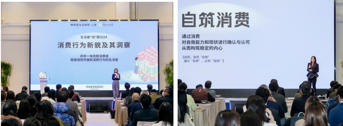
Last year's Dynamics of Chinese People by HILL Shanghai

attitudes: using AI for self-improvement and self-rediscovery, not just for improving task efficiency.