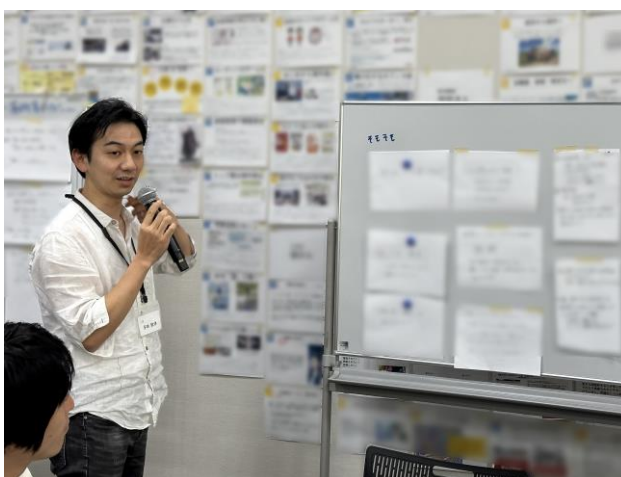
Right: Members from HILL Shanghai and HILL ASEAN attend the workshops, in addition to HILL Japan staff