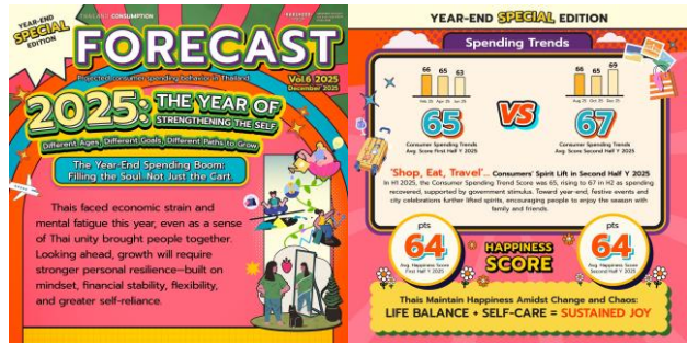
Right: Excerpts from a report published by HILL ASEAN (Thailand)