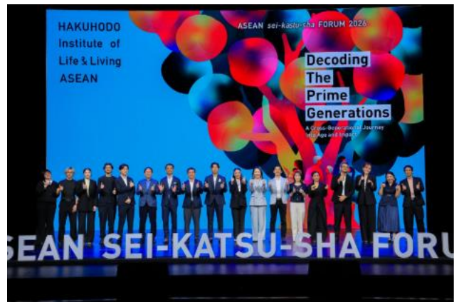
World Premier of HILL ASEAN's ASEAN Sei-katsu-sha Forum in Thailand

ITO: Thank you very much. All of your themes sound interesting as they offer foresight into the coming future in each country and area. I can't wait to see the findings!