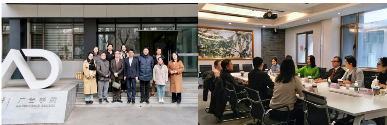
Information-sharing session between the Communication University of China and HILL Shanghai

specialized external agencies. In short, our uniqueness lies in the depth of such ongoing research and the accumulation of sei-katsu-sha data that comes with it.