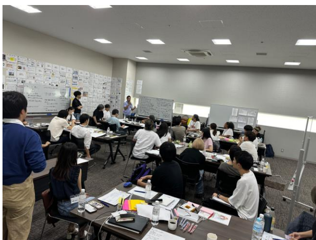
Left: A workshop at HILL in Japan

HOKARI: We are particularly determined to be the first to identify small signs of change in individual sei-katsu-sha , in addition to performing quantitative analysis, and present them with the original perspectives of researchers. Taking food as an analogy, we aim to deliver curated fresh, unwashed vegetables, rather than neatly processed ingredients. We thus delve into the realities of sei-katsu-sha at the “n = 1” level that do not show up in statistics, convey them as vivid information, and shape the future with companies. That’s our style, and one of the interesting features of HILL.