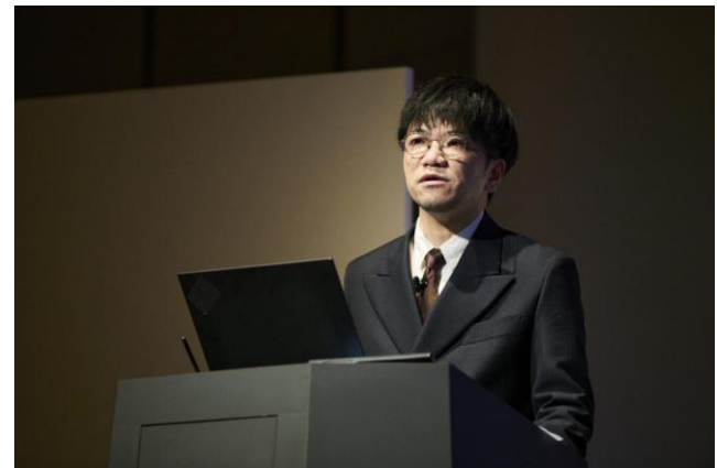
Last year's winter lecture by HILL Japan